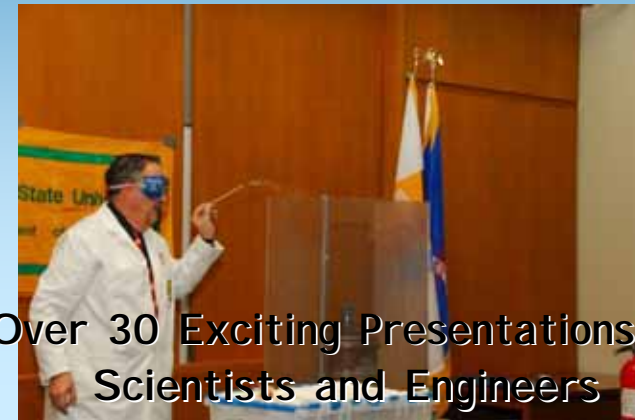
Over 30 Exciting Presentations by Scientists and Engineers