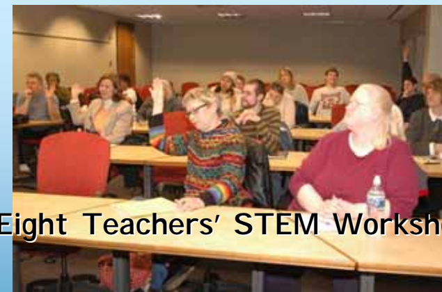
Eight Teachers' STEM Workshops

David Ponitz Center (Bldg 12), Sinclair Community College Affiliate Societies Council