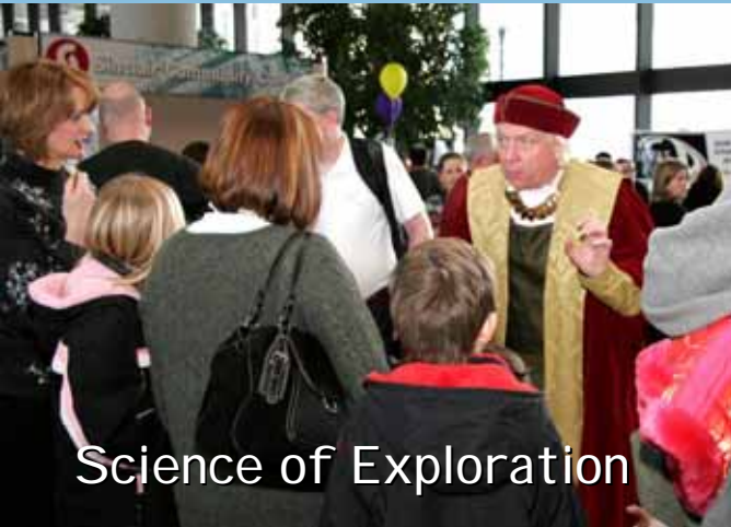
Science of Exploration