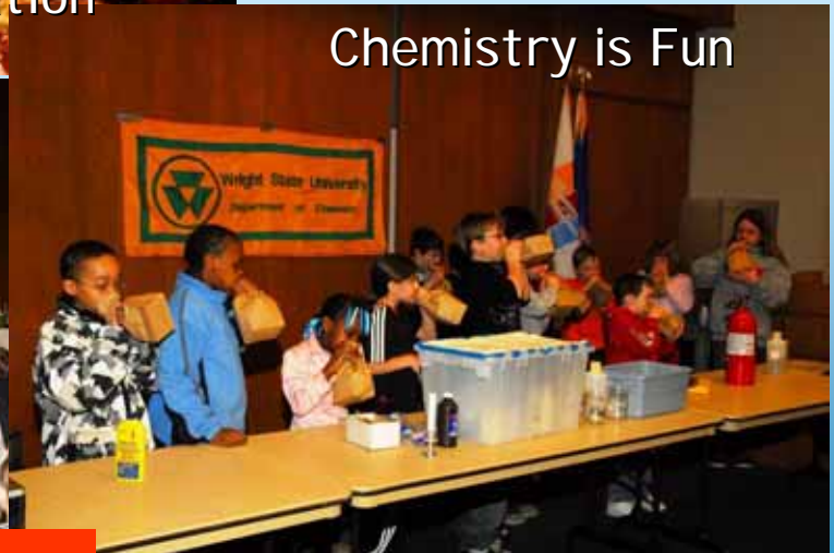
Chemistry is Fun