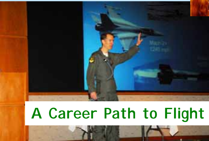
A Career Path to Flight