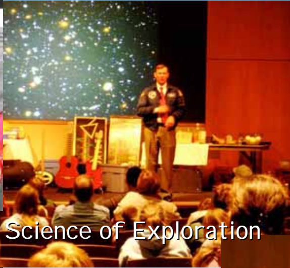
Science of Exploration