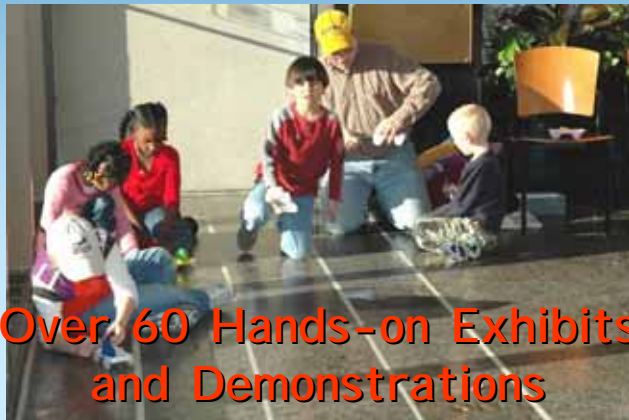
Over 60 Hands-on Exhibits and Demonstrations