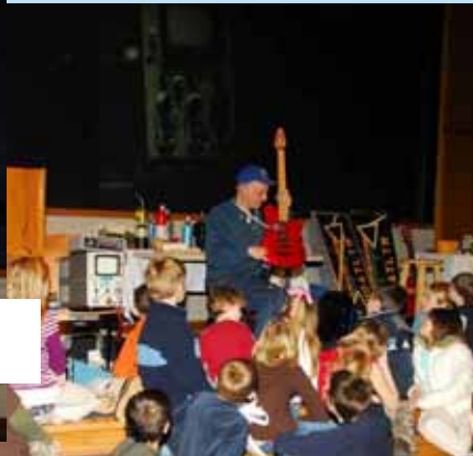
Science of Music